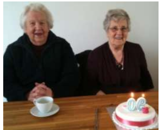
Getting ready to cut the cake