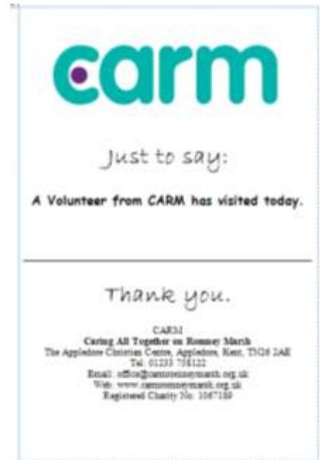
Example of calling card

Sadly we are visiting at home more and more people who have memory difficulties. We thought it might be helpful for all our befrienders going into the home of someone who may not always remember they had a CARM visitor left a 'calling card' to say a that a CARM befriender has paid a visit that day. We have designed a very simple slip to leave at the client's home and will be distributing them to appropriate volunteers.