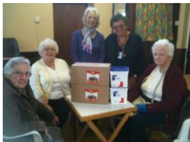
Hand over of soup at Dymchurch Meeting Point

The soup that Bachelor's factory based in Ashford kindly donated to CARM for Meeting Points has now been distributed. The larger cartons of soup I passed on the Salvation Army and the Rainbow Centre for their use. I hope to apply again later in the year.